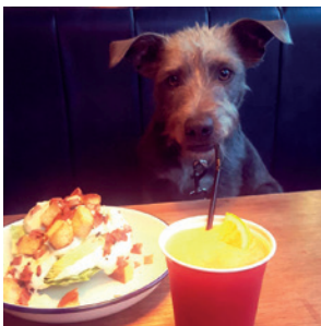
BALOO, THE FAT WALRUS RESIDENT PUB DOG